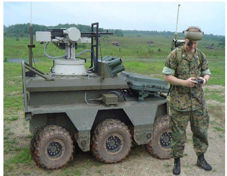
USMC Gladiator Tactical Unmanned Ground Vehicle