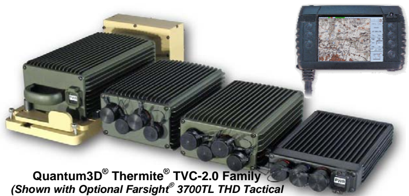
Quantum3D ® Thermite ® TVC-2.0 Family (Shown with Optional Farsight ® 3700TL THD Tactical Handheld Display)

The Thermite TVC is the first multi-role, small form-factor, COTS family of tactical computers specifically designed to enable PC-based, 2D/3D graphics and video-intensive, network-centric C4ISR, C2, UV-control, embedded-training, maintenance and mission-rehearsal applications to be deployed in both vehicle-based and man-wearable applications in harsh environments. The Thermite TVC family supports open-architecture PC operating systems and features advanced embedded computing, 2D/3D mobile graphics, video capture-and-display, and low-power consumption for long battery life. Thermite TVC supports extensive commercial and military I/O options including GPS, wireless network and tactical radio support—packaged in a lightweight, conduction-cooled, alloy enclosure for operation in Mil-Std-810F, Mil-Std-461E and Mil-Std-1275 extended environments. The Thermite TVC-2.0 family includes a range of models tailored to meet the specific needs of man-wearable and vehicle-based ground, naval and airborne applications. The combination of these unique capabilities allows system integrators employing Thermite to rapidly bring the power of PC-based workstation applications to forward operations, which is why the U.S. military, as well as allied governments and leading international companies have selected Thermite TVC-2.0 and companion Farsight Tactical Handheld Displays for operational deployment in extended environment military and civilian applications.